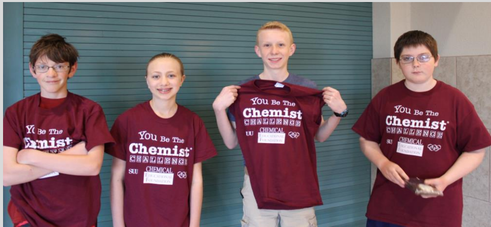
Canyon View "You Be the Chemist" winners